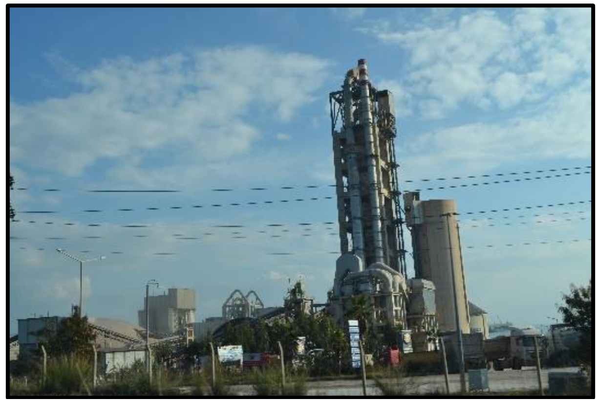
Photo 5. Cement Factory (4.5 km to the northeast of the Project Site)