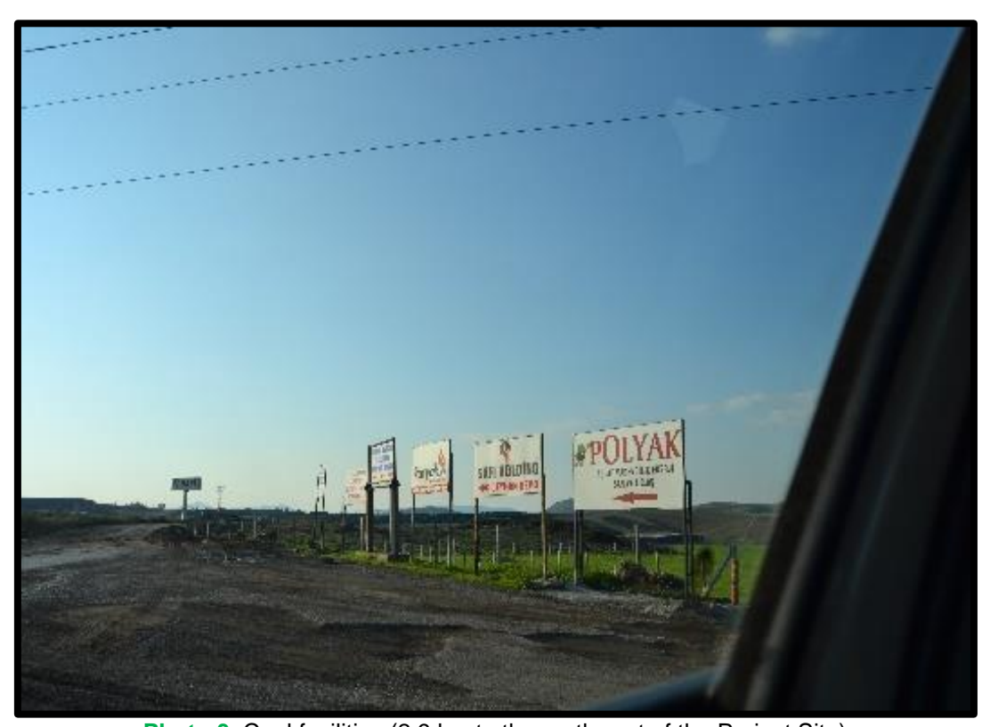
Photo 3. Coal facilities (2.9 km to the northwest of the Project Site)