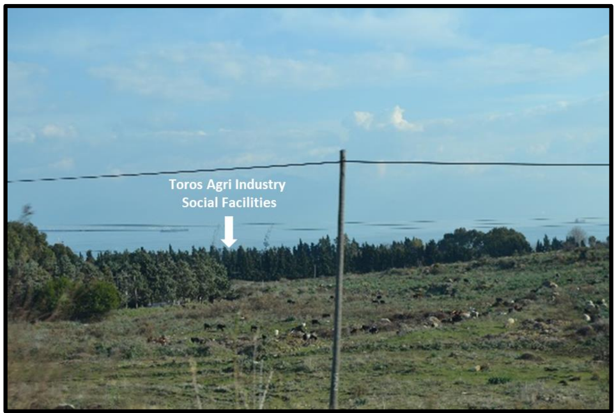
Photo 4. Toros Agri Industry Social Facilities (2.2 km to the northeast of the Project Site)