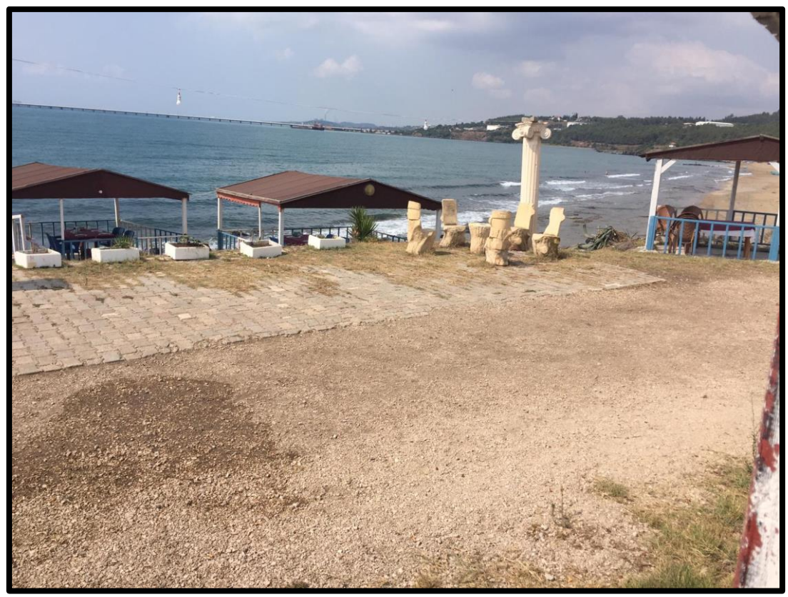
Photo 1. View from Fishery restaurant (Access, inside and outside of the restaurant)