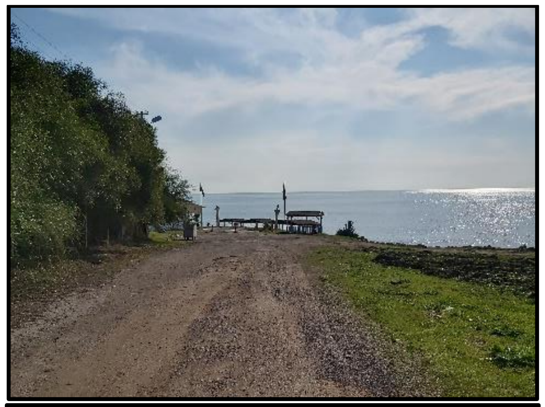
Annex-E: Land Use and Zoning Supporting Information