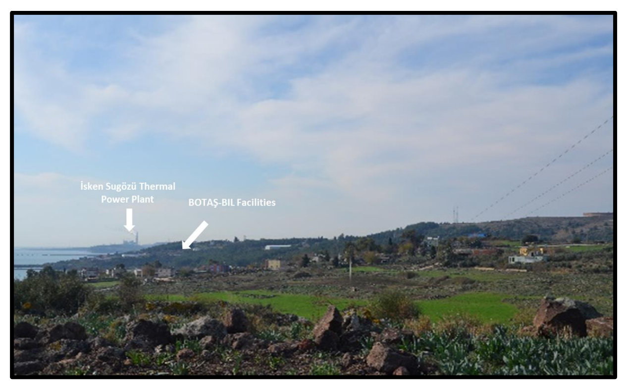
Photo 6: Isken Sugözü Thermal Power Plant (9.7 km to the southwest of the Project Site) and BOTAŞ Facility Premises (1.2 km to the southwest of the Project Site) (view from the Project site)